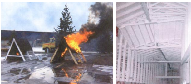
Left: SafeCoat® coated interior roof space and an untreated roof space under identical fire conditions. Right: According to the NFPA-13 Standard, installation of sprinkler systems are not required if the exposed combustible materials have 25 or less/Class A Flame Spread.

When a more resilient, durable surface than drywall is required, plywood or OSB coated with SafeCoat® Latex can provide an inexpensive and effective way to satisfy the Code for a Class A Flame Spread and Smoke Developed Rating.